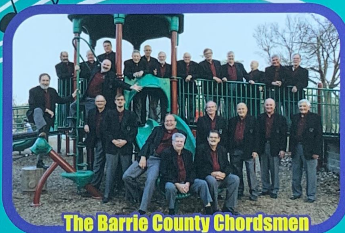
The Barrie County Chordsmen

A 2-hour show jam packed with performances by the Barrie County Chordsmen (2015 Ontario Champions), Toronto Northern Lights (2013 International Champions) and the Barrie Soundwaves (Sweet Adelines International) choruses, plus several quartets including Nostalgia Express (2019 Ontario Senior Champions), Gummie Boys, and Prime Time!!!