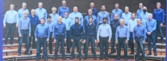
Toronto Northern Lights